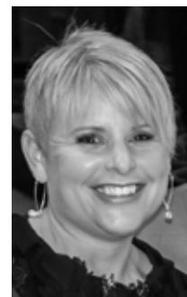
Chief Training Team